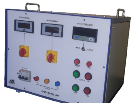
Control Panel Unit

MG Set KVA Rating of transformer under test