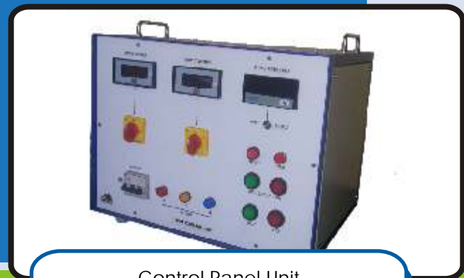
Control Panel Unit